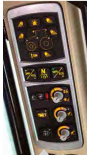
Pillar mounted PTO speed selection controls and linkage controls.