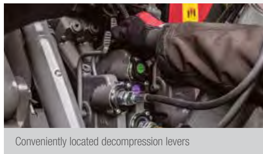
Conveniently located decompression levers