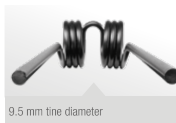
9.5 mm tine diameter

The Super C tine has a tine diameter of 9.5 mm, a coil diameter of 70 mm and six windings, making it one of the most efficient on the market and typical of the high quality of each and every Massey Ferguson hay tedder.