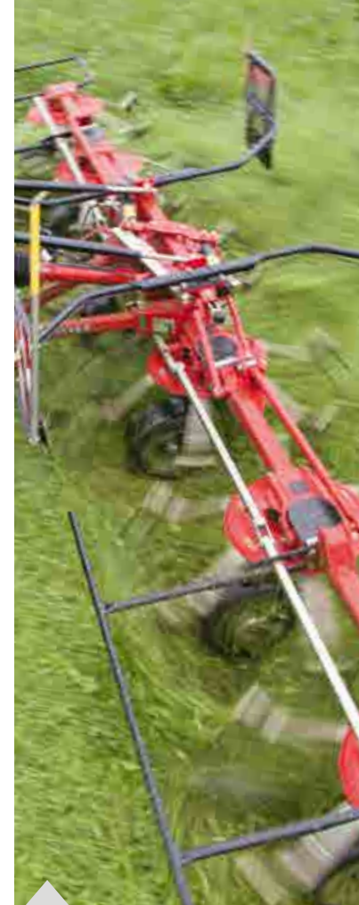
Page 06 Forage quality features