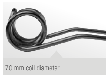
70 mm coil diameter