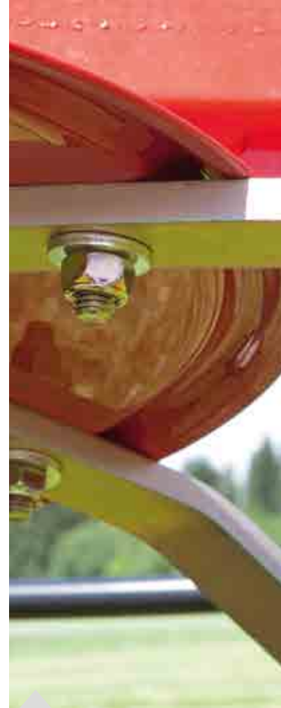
Page 07 Best harvest - fast and low-impact