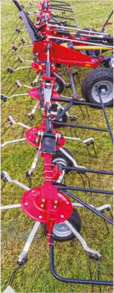
Page 08 MF Hay Tedders with transport chassis