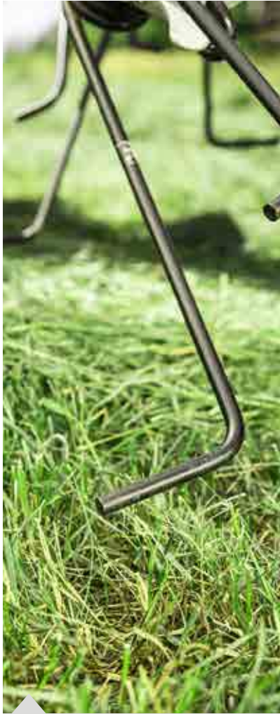
Page 10 Specifications