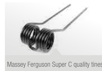
Massey Ferguson Super C quality tines