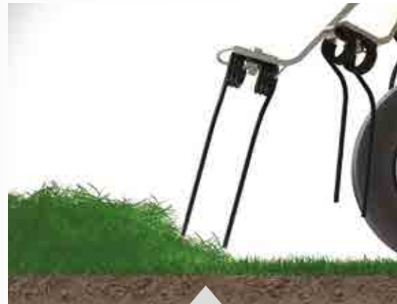
Tines with equal sides with comb effect