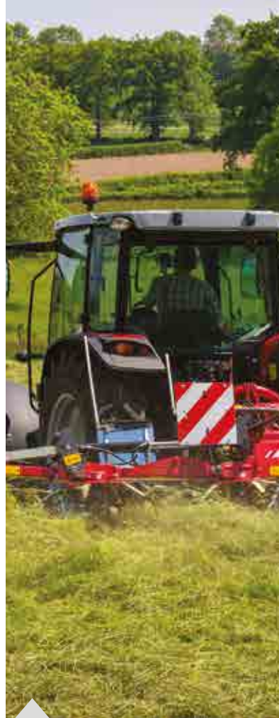
Page 04 Massey Ferguson TD Series Tedders