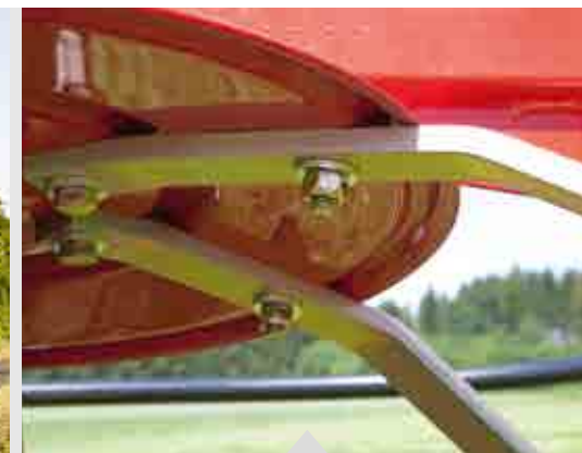
Wide contact surface for optimum power transmission