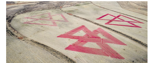
A roughly 150m x 210m Massey Ferguson logo sprayed onto a field.