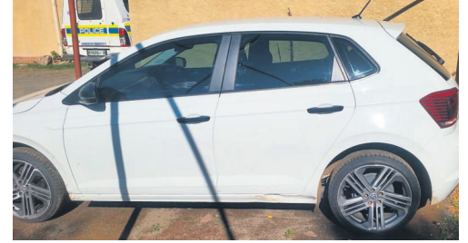
The white VW Polo that was seized in Winburg during a foiled burglary.