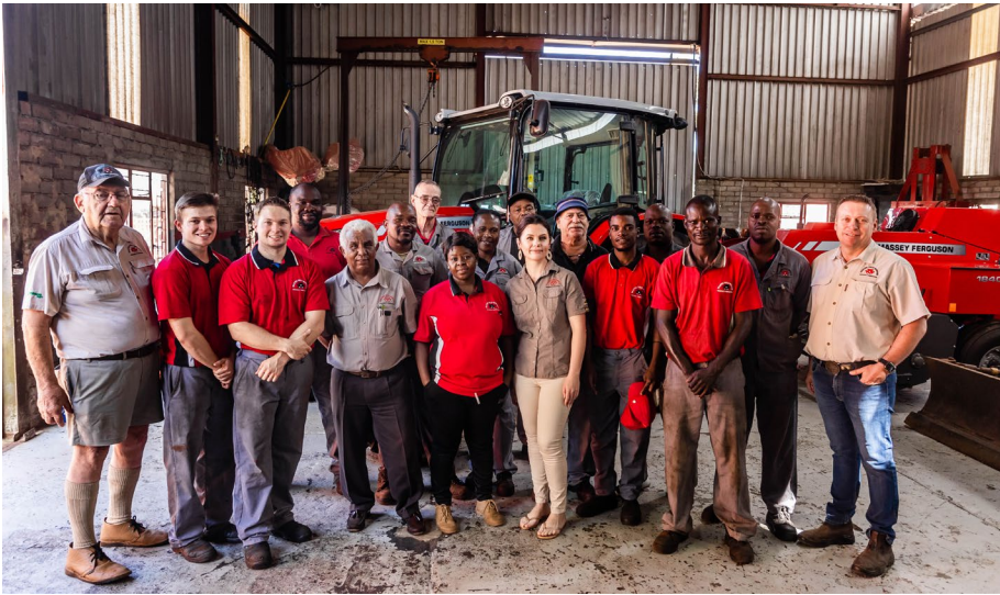
Tractor Field Service's team of dedicated people provides first-class service – from sales to long after.

it only makes farming management easier for you."